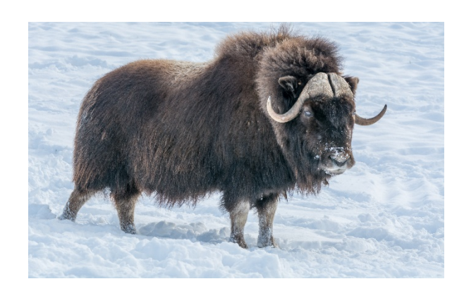
Contact information: Environment and Natural Resources Education, Culture and Employment www.gov.nt.ca

This on-the-land skills training encourages student leadership and other valuable skills, while promoting a connection to, and respect for the land.